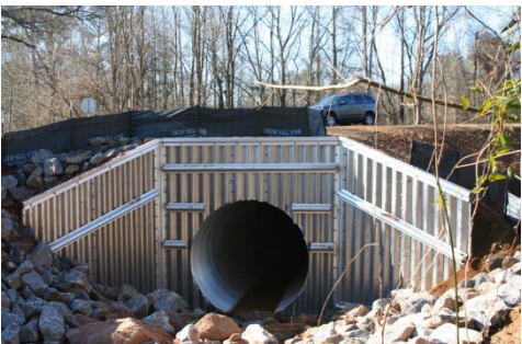
Use Pipe Wingwall